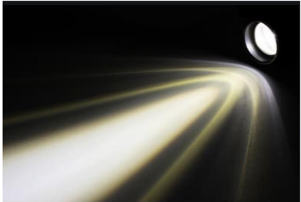
The Focused Torch Beam