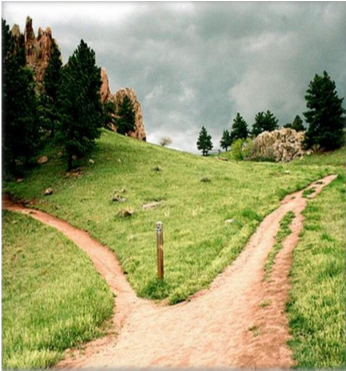
The Two Path's